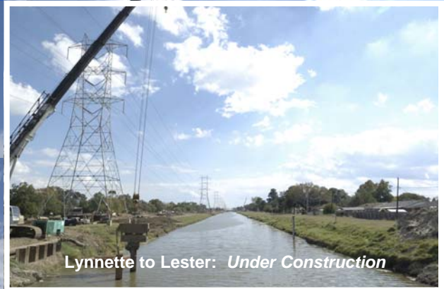
Lynnette to Lester: Under Construction