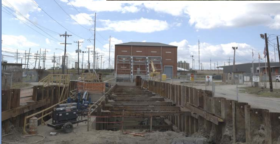
Above: construction proceeds on the intake culvert toward the recently-completed Dwyer Road Pump Station. Inset: this is a Giken Hammer, a silent pile driver that is used by SELA contractors to reduce noise and vibration in residential areas.