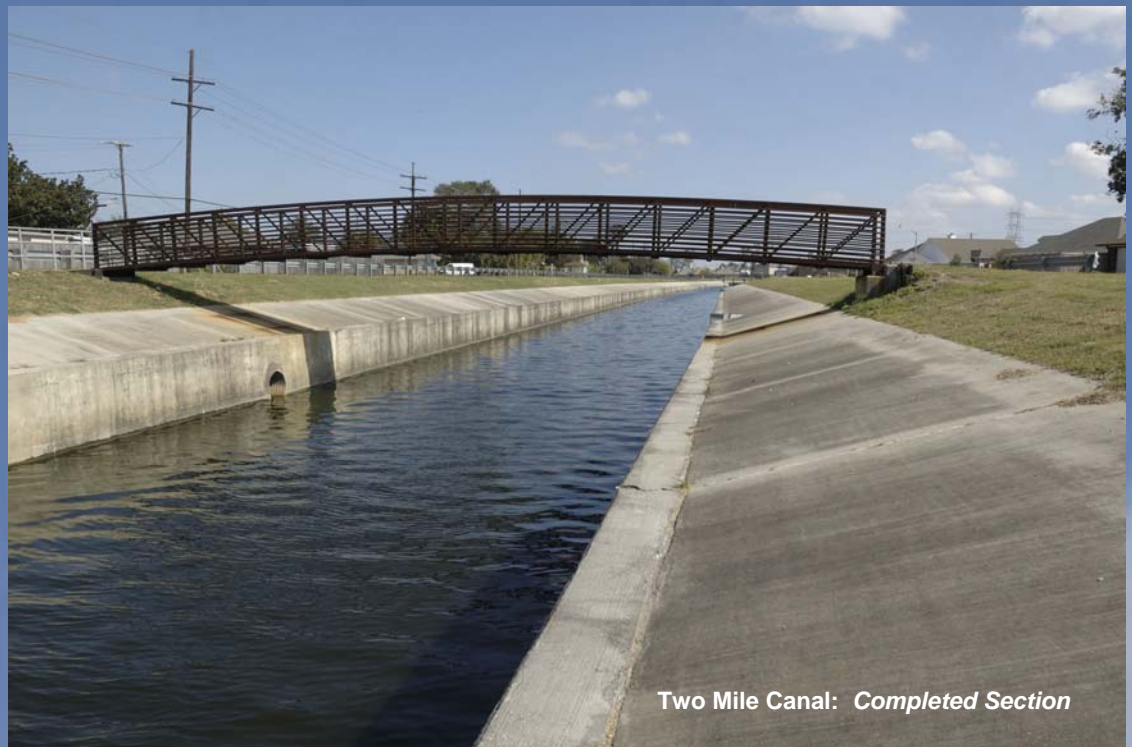
Two Mile Canal: Completed Section