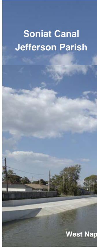
West Napoleon to Lynnette: COMPLETE

nel and pumping station improvements in Orleans and Jefferson Parishes support the parishes' master drainage plans and provide flood damage risk reduction up to a level associated with a 10-year rainfall event. A 10-year event is basically a rain storm that has a 10% annual probability of occurrence and equates to approximately nine inches of rain over a 24-hour period for our area.