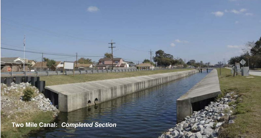
Two Mile Canal: Completed Section