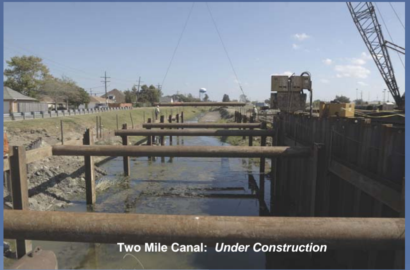
Two Mile Canal: Under Construction